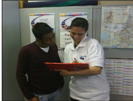
Expression of Interest